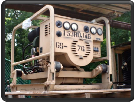
Generators: Various sizes $395 - $5,000