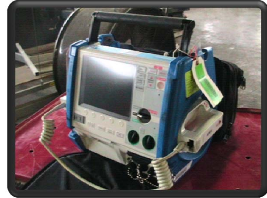
Zoll Defibrillator $425.00