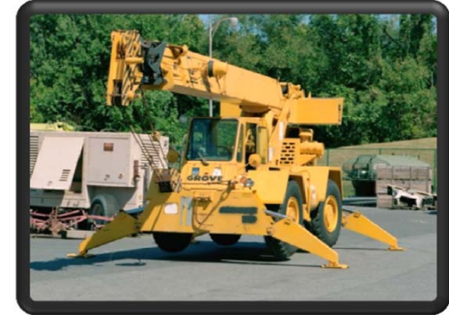
Rough Terrain Container Crane 40 Ton $6,500