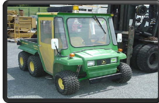
John Deere Gator 6x6, full cab $3,500