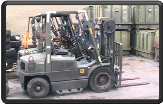
Hyster Forklift Diesel, Good Condition $3,500